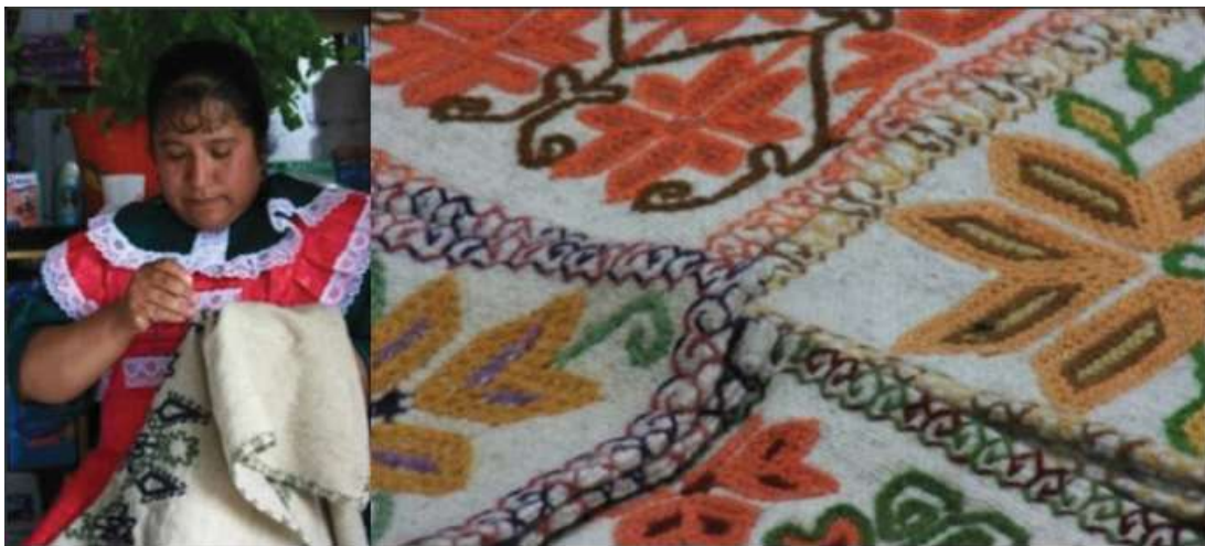
FIGURE 1: A PHOTOGRAPH TAKEN WITHIN THE COMMUNITY SHOWING A WOMEN TAKING PART IN TRADITIONAL HAND TEXTILE CRAFTS AND THE MATERIAL PRODUCED.

The primary method of data analysis involved the codification of answers by highlighting phrases and words which were mentioned multiple times. A colour coding system was adopted in order to show the relative importance of each significant phrase. Words and phrases were deemed of higher significance based on the number of repetitions of similar phrases amongst respondents.